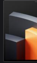
FLEX 3 22"