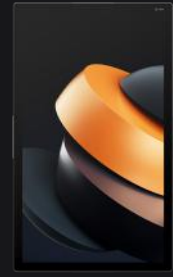
FLEX 3 27"