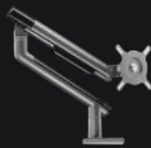
*Wall Mount (From third-party brands)