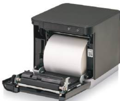
Front Paper Loading