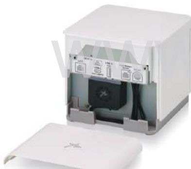
Optional mC-Sound Buzzer