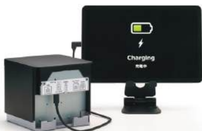
Sync & Charge with USB-C