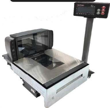
FX131-A - 9300i / 9400i