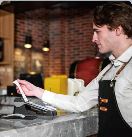
Delivery Order Management