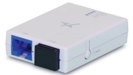
MCW10 Wireless LAN Module

The new TSP100IV from Star brings a unique new design for a truly revolutionary product. The quality and reliability of the popular TSP100 series has been fused with enhanced connectivity and specialist printing features for the very latest in point of sale and omni-channel commerce. For the ever-changing retail environment, the TSP100IV has every angle covered!