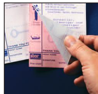
Original + 2 Copies