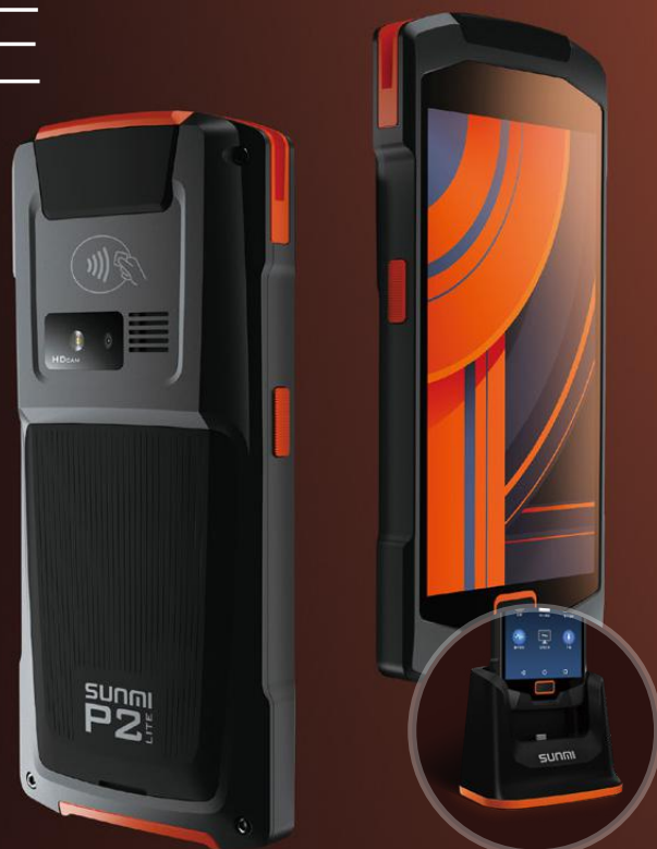
Optional single stand charger