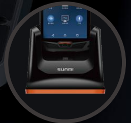
Optional single stand charger