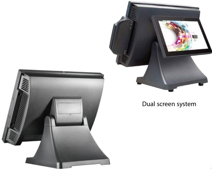
Dual screen system