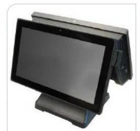
14.1 inch 16:9 LCD customer display