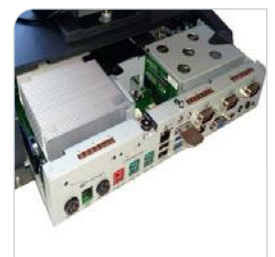
Slide in / out mother board

Specifications are subject to change without notice - © AURES 2016