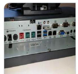
Extensive I/O ports