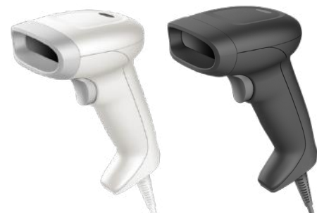
Voyager 1350g is an affordable 2D Area imager scanner

Voyager 1350g supports all popular 1D and 2D barcodes, as well as image capture capability. Incorporating latest technology from Honeywell, Voyager 1350G is easy to install and configure, the user being able to quickly select configurations and personalize the scanning experience. Voyager 1350G is compatible with Honeywell's advanced EZConfig and support all common POS drivers, being ready to adapt to different applications and requirements.